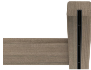
Units Standard with Steel Channel Positioned Within a Routed Post