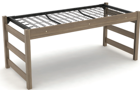
Junior Loft JL-3680-SC with Optional Facia Panel