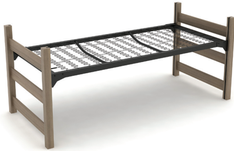
Junior Loft JL-3680-SC