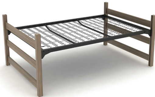
Junior Loft JL-5480-SC